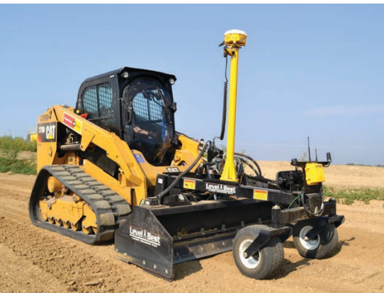
ATI Level Best PD Series Grading Box and Trimble GCS900 Grade Control System with Single GNSS