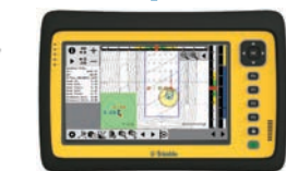
Trimble Site Tablet